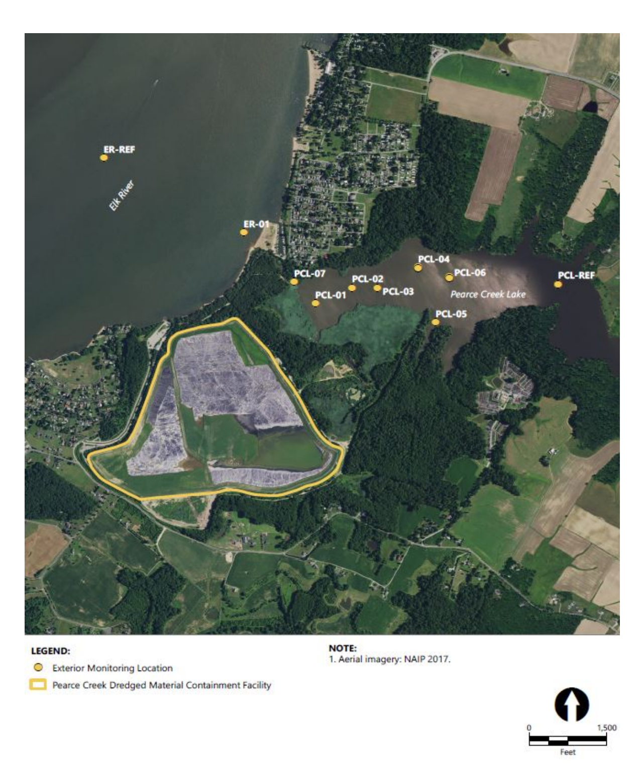
FIGURE 1. EXTERIOR MONITORING LOCATIONS